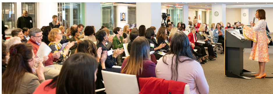
Over 100 people gathered to honor and learn about the 2020 grantees