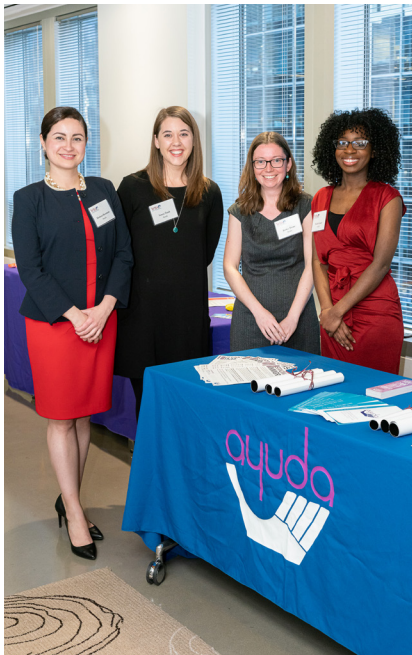
Representatives from Foundation grantee Ayuda